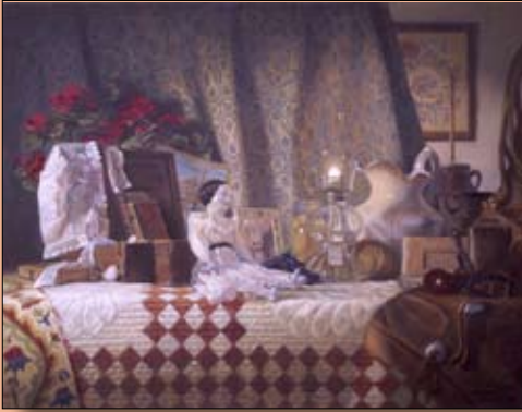
Blending Many Traditions to Form a Union