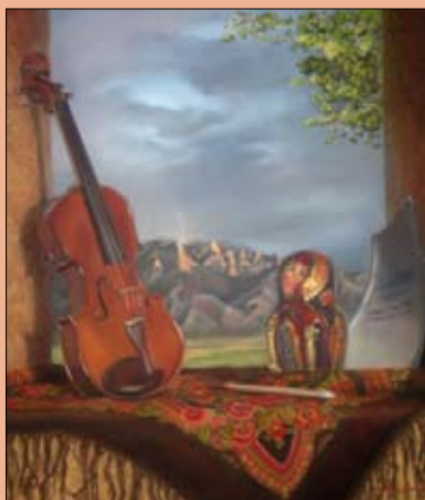
Sonata Number One 24" x 21" Pastel