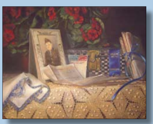
The Answered Prayer