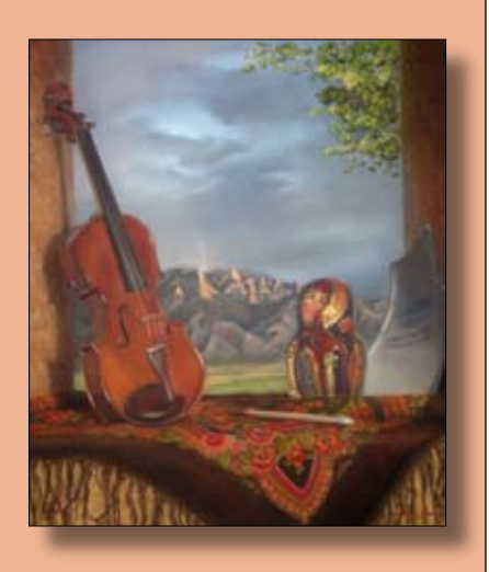
Sonata Number One 24" x 21" Pastel